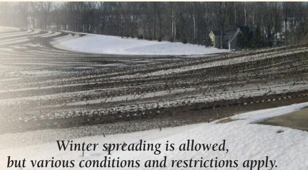
Winter spreading is allowed, but various conditions and restrictions apply.